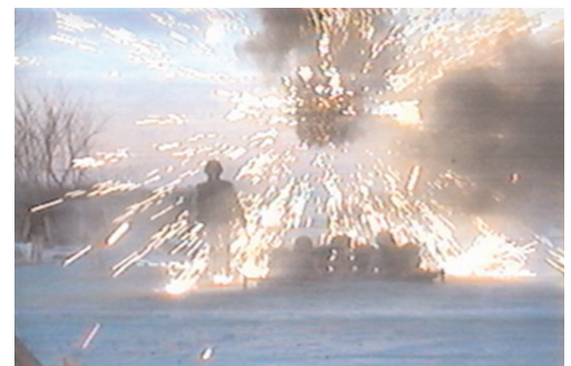
LW25mm Airburst Round